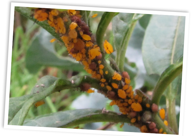
Some aphids are even pretty.