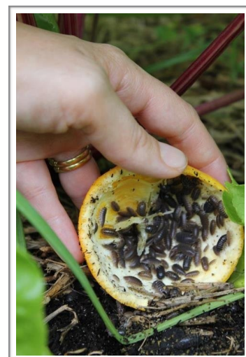
Slaters trapped by hiding in half an orange-green life soil co